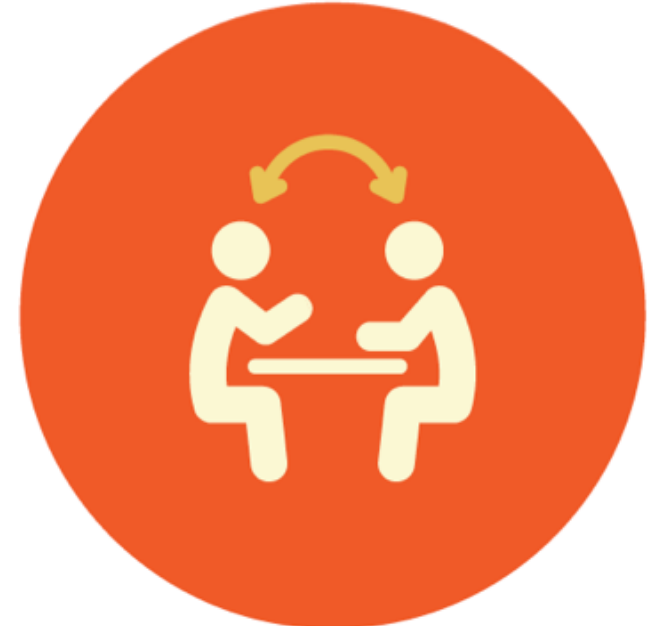
YOUTH PROGRAM SUPPORTS