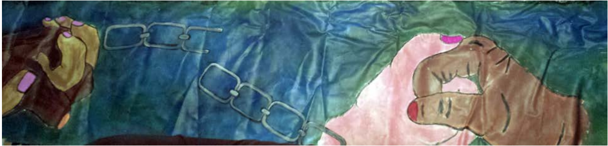
Figure 5: All Directions Mural - while many hands were painted on the mural to symbolize partnerships, broken chains were also painted to symbolize not only the histories of enslavement for Indigenous and African diasporic peoples, but also the racial, cultural and socio-historical tension/conflict that surfaced throughout the workshop.