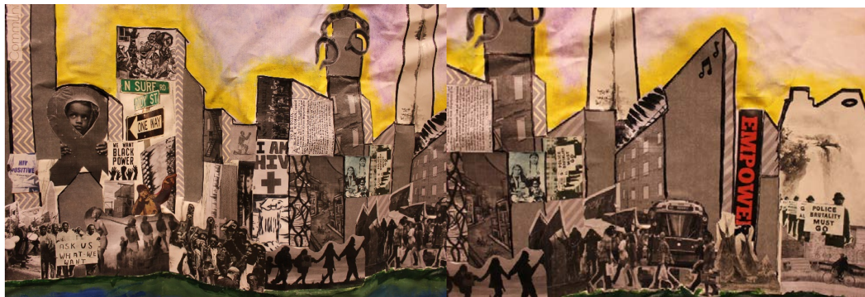
Figure 3: The use of collage in the All Directions Mural.

In the focus groups, the process of sharing digital stories was an important step in mutual education and bridging connections between the groups of young people. This process helped them gain insight into each other's narratives and experiences. This platform of sharing also provided each youth insight into the struggles going on in the communities of other youth in the workshop. The youth had a lot to say about each other's stories and the ways in which they connected to these narratives. For instance, both Aboriginal and Black young people really related to the digital stories that spoke about the sexuality and self-esteem of young women in their communities; teen pregnancy; lateral violence and internalized racism; and narratives of personal redemption and walking a positive/good path.