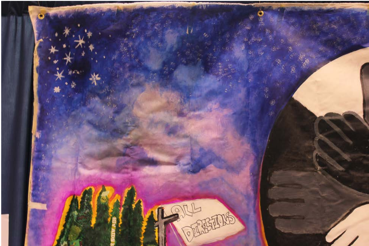
Figure 4: All Directions Mural – Among the messages represented on the mural through histo-cultural symbols, the night sky in the top left corner of the mural is where one of the Indigenous youth saw a grandfather spirit.