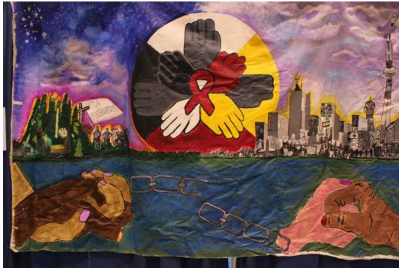
Figure 2: Collaborative Mural – All Directions

In the talking circles, many youth expressed this positive sentiment about the utility of such alliances for progressing the fight against HIV in communities with similar, yet distinct experiences of oppression. These participants identified with the struggles of colonization and marginalization experienced by youth from different communities and cultures, and they were optimistic that working together would mean that more people could be mobilized if they would understand the cross-cultural underpinnings of the social determinants of HIV.