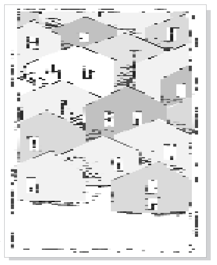
sample recruitment flyer

A preliminary application form should request name, present mailing address, Social Security number, telephone number, current income, educational background, work experience, hobbies, and emergency-contact person. The application should determine motivation to join the program and what the applicant hopes to accomplish. Knowledge of construction should be ascertained. A sample application follows.