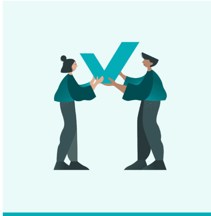
CAPACITY BUILDING Learn by YouthREX