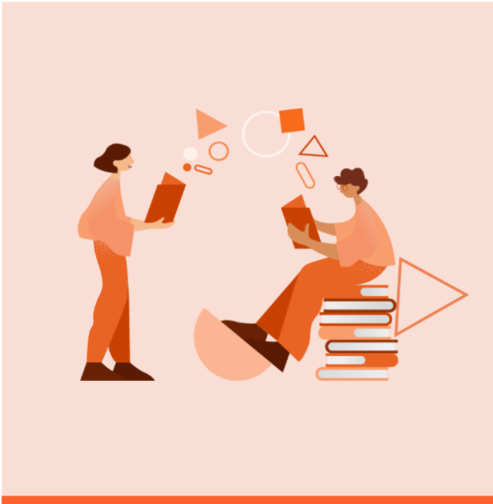
KNOWLEDGE EXCHANGE Knowledge Hub & Events