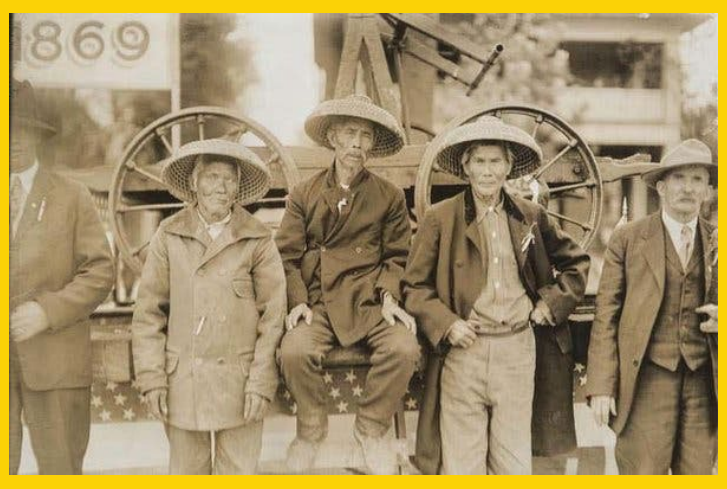
Chinese labor workers

Some scholars cite Chinese immigrants' vital role as railroad workers to the common Asian slur, "chink." The onomatopoeia mimics the sound of Chinese immigrants' tools as they worked on the transcontinental railroad.<sup>6</sup>