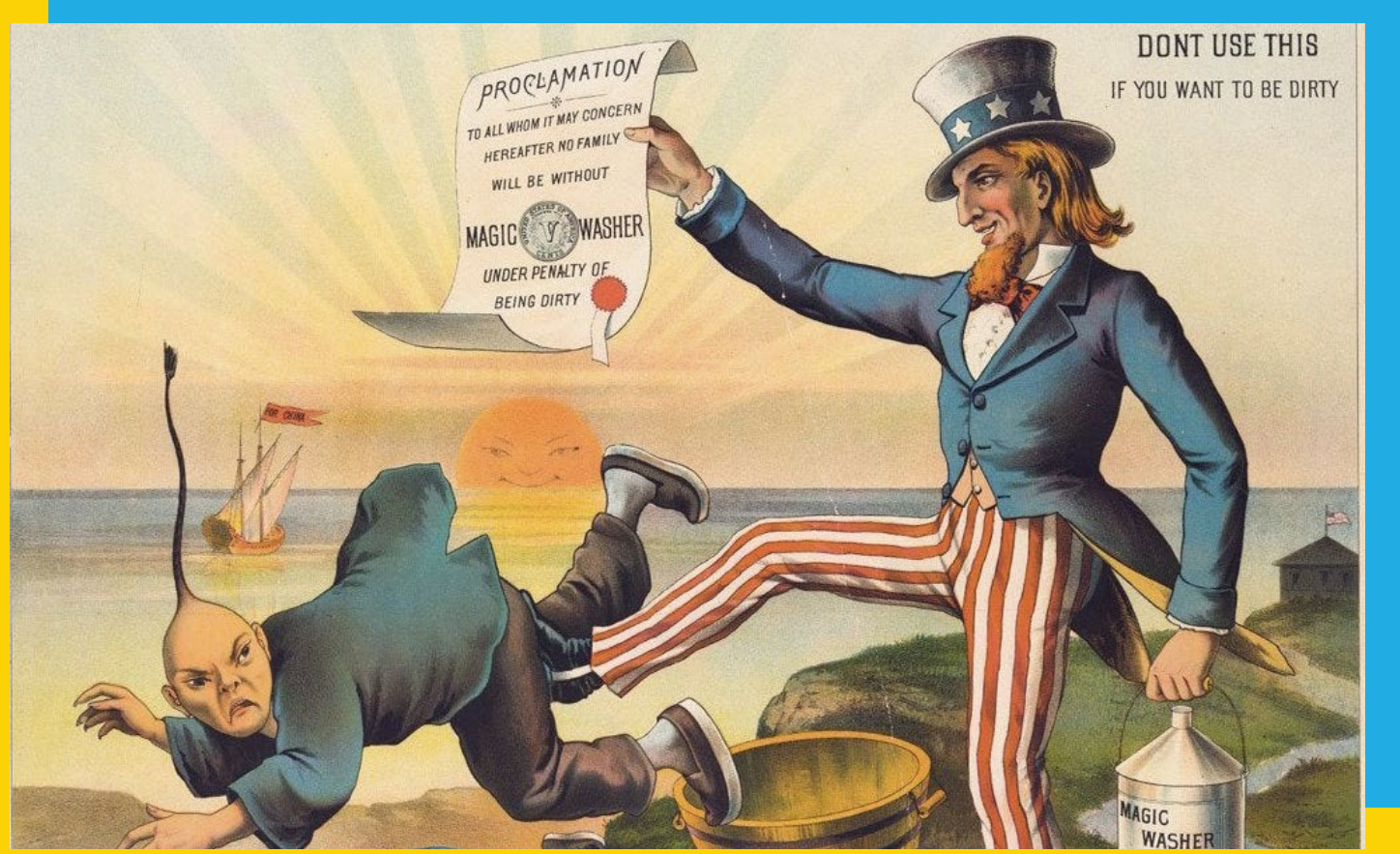
Soap advertisement depicting Asian men as dirty

men, thus denoting them as undesirable and immoral.<sup>8</sup>