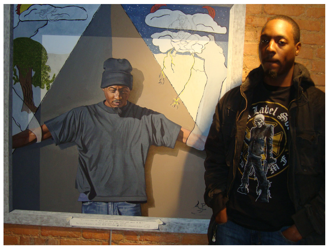
Self-portrait of program participant